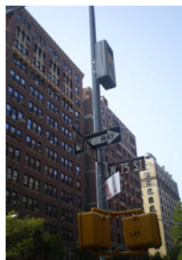
The mysterious grey box

Maybe you've seen the cell sites above you on top of buildings or the fake trees alongside the interstates. This box looks