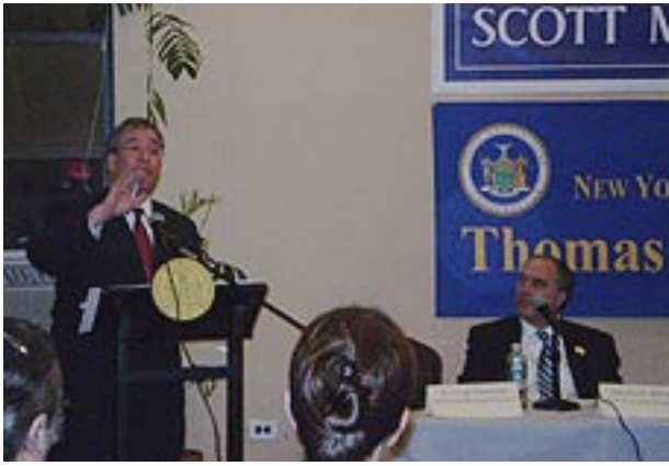
Manhattan Borough President Scott M. Stringer addressed a packed auditorium at a June 11 forum on preserving local West Side businesses. That's forum co-sponsor Thomas P. DiNapoli, NYS comptroller, at the table.

Dismay that Broadway has become a corridor of banks, chain stores, and nail salons (how can they afford it?) escalated.