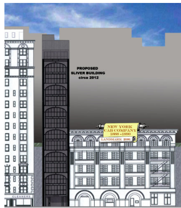
Rendering of proposed sliver building for 207 West 75th Street

After two well attended Community Board 7 Land Use Committee meetings, where community members opposed to the project well outnumbered those siding with the developer, the committee voted to reject the developers' request for a variance to build above seven stories. The developer claims that this would present a financial hardship for him.