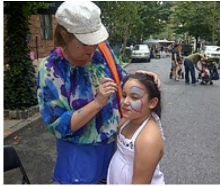
Face painting is always popular. Should Lady Gaga be worried?