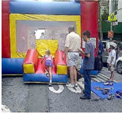
A child clambers up into the Bouncy Castle to join the jumpers.

See more photos from BLOCK BLAST 2011 on the website: www.w75ba.org