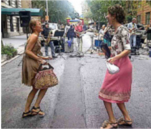
There was dancing on the street, with music provided by the Narwals.

See more photos from BLOCK BLAST 2011 on the website: www.w75ba.org