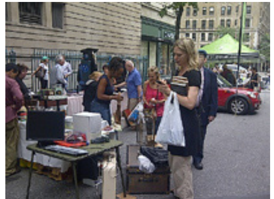
The rain didn't come to our September block fair, but the shoppers did. Could this visitor be texting a friend about bargains to be found on West 75th Street?