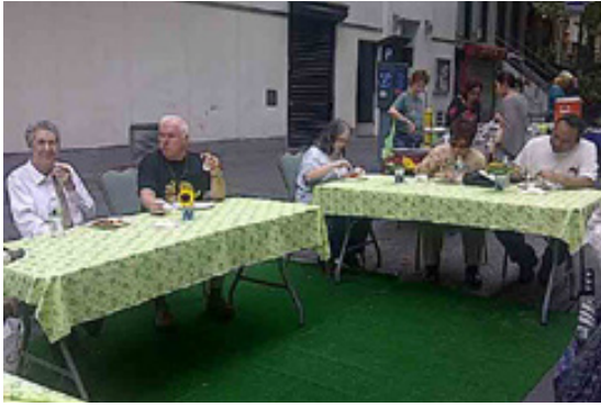
We introduced the W75BA Café at BLOCK BLAST 2011.