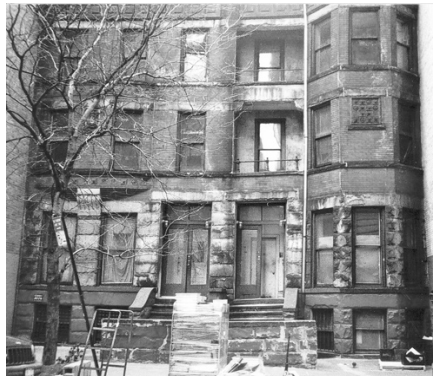
Beekman houses on West 74th Street

72nd Street, and got the MTA to pay for it. According to the Park Department's Arts and Antiquities Director, it commemorates nothing, but remains a unique decoration. We're lucky to have it, and it was our editor who prompted the story.