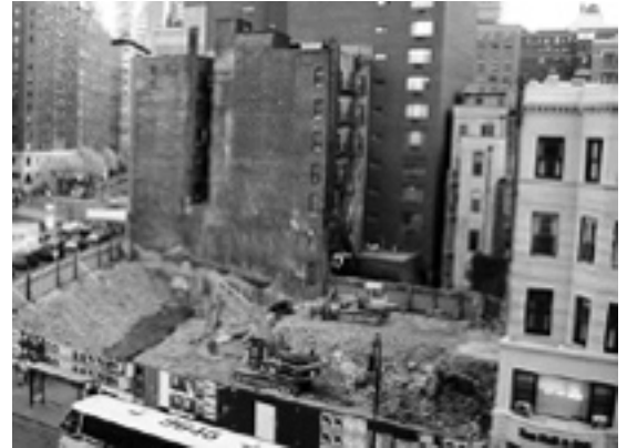
According to www.curbed.com, a real estate gossip site that publishes "rumors, conjecture and opinions, as well as accurately reported factual information," earlier renovation plans for the former Colonial Club site at 72nd and Broadway may have been scrapped. As of May 3, a tipster reported, "... the wrecking crews have been idle for the past week. Rumor has it there may have been damage caused to the adjacent buildings."